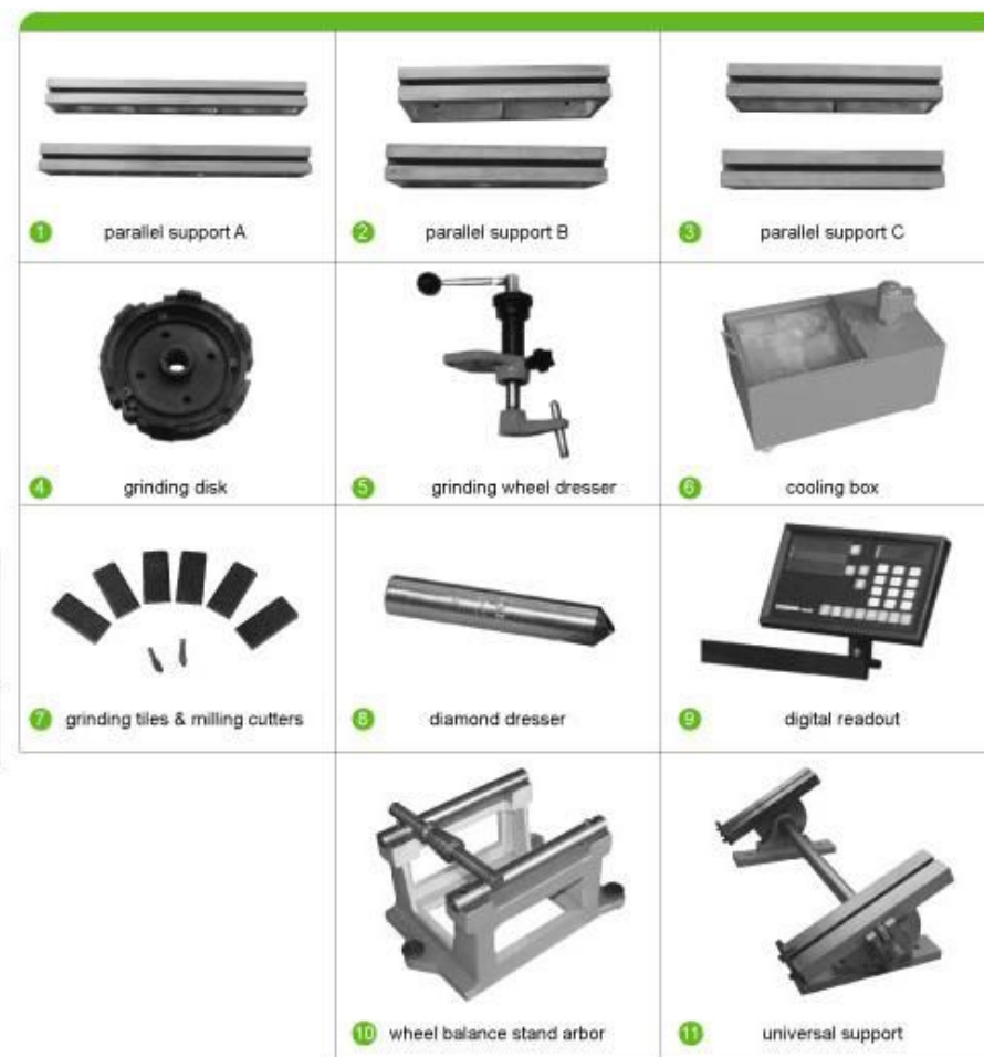
Table of Standard and Optional Accessories